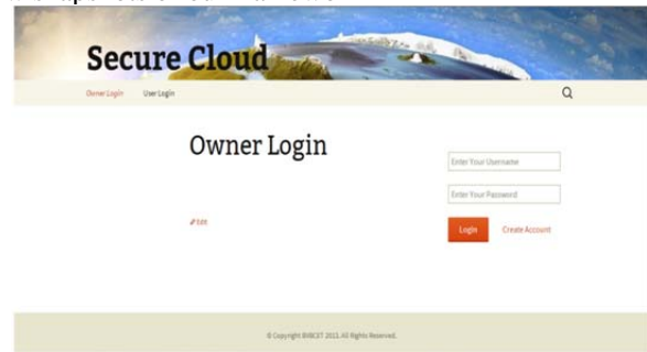
Fig (a): Login page of our framework

The fig (a) shows the view of login page of our Framework. The logging mechanism consists of user name and password.