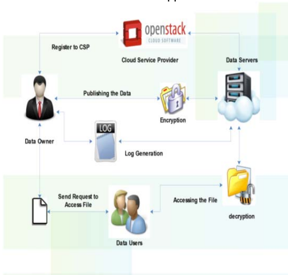
Fig.(a). Overview of the proposed system.

In this phase we create a GUI page, which acts as a median to connect the user with the cloud and through which user can able to send request to the cloud, by mean time cloud server can send the response to the user. In other words, this phase establishes the communication between the user and the cloud. So with this GUI page user can able to know about the overview of the whole application.